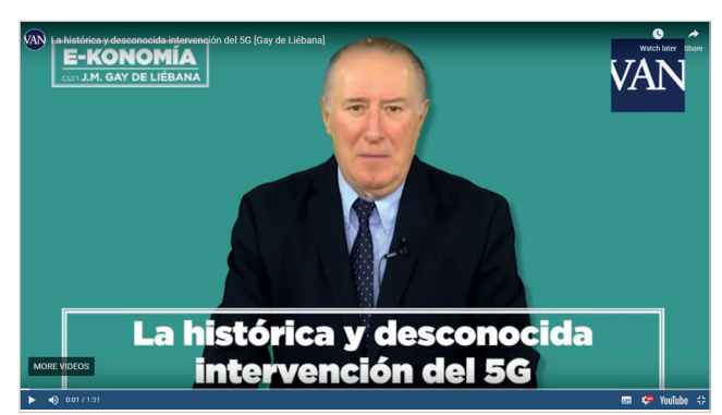
E-Konomía by J. M. Gay de Lièbana https://www.lavanguardia.com/autores/jose-maria-gay-de-liebana.html

El país has few collaborations that follow a clear schedule<sup>4</sup>. Besides El video blog de Iñaki Gabilondo, which is devoted to political analysis, and El rincón de los inmortales, where historical chess moves are analysed, El país seems to focus on current affairs to offer videos with short-term scheduling that are linked to a range of journalism situations. This strategy is shared by other newspapers. Current affairs undoubtedly influence the contents of newspaper profiles on You-Tube. In parallel, newspapers strive to incorporate a scheduling strategy. For example, El confidencial offers weekly summaries of the 'Procés' (in relation to the independence movement in Catalonia), and both La vanguardia and El mundo report weekly on YouTube on the Supervivientes reality show.