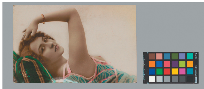
Figure 2. Human portrait. Monochromatic photographic print, hand-colored in ink. Early 20 th century.