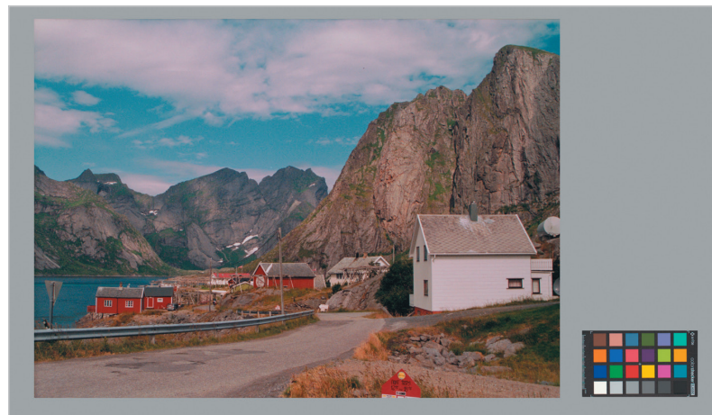
Figure 1. Mountain and water landscape. Matte color photographic print. Late 20 th century.

Table 2 shows calibration conditions according to ISO 12646 and Table 3 shows the adjustment and calibration data for the experiments viewing environment.