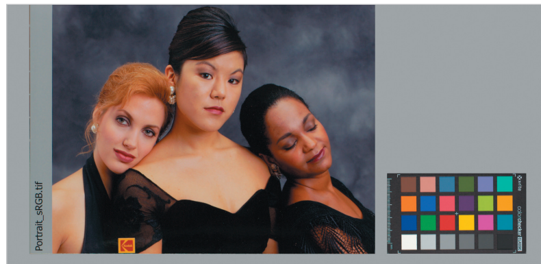
Figure 3. Human portrait. Glossy color photographic print. Early 21 st century.