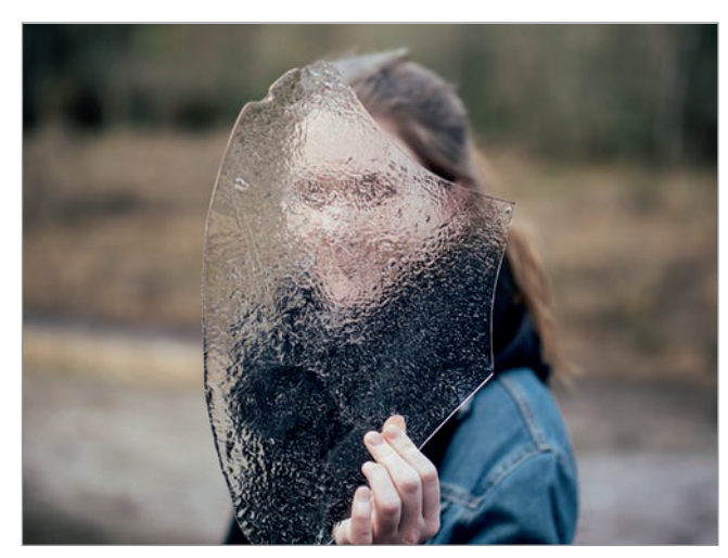
...sometimes it's that the source wants to be anonymous.

"there is a structural problem and lack of maneuverability. In France a director of an outdoor area can grant an interview or participate in a live program, in Spain that is currently unthinkable."