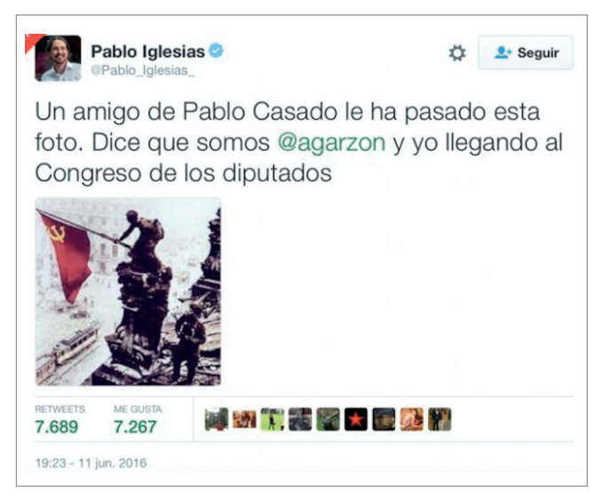
Image 2. Most retweeted tweet of the campaign<sup>2</sup>

by the leader of Podemos seemed to be aimed at reaching a direct and close relationship with the people who he interacted with. In fact, 25.7% of his tweets were answers or questions to other users within his social network. Iglesias's discourse was also notable for including matters relating to his private life. In 11.9% of his tweets, he shared his tastes, interests, feelings, and emotions.