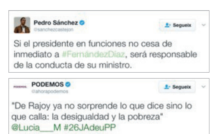
Image 1. Tweets criticizing the management of Mariano Rajoy¹

The second complementary function was criticism (Table 2), as both parties and leaders used Twitter as a way of attacking their political opponents. This function was especially used in the profiles of the parties in opposition to the Government led by Partido Popular ( People's Party ). The PSOE devoted 26.7% to criticism, Podemos 21.9%, and Ciudadanos 21.7%. Regarding the candidates, while Sánchez (18.1%) and Rivera (13.6%) emphasized the use of this function, Iglesias included it in only 5% of his tweets. PP (14.2%) and Rajoy (2.8%), as representatives of the Government, reduced the use of Twitter to criticize other parties and exploited it as a channel for praising and highlighting their own achievements (12% and 6.9%, respectively).