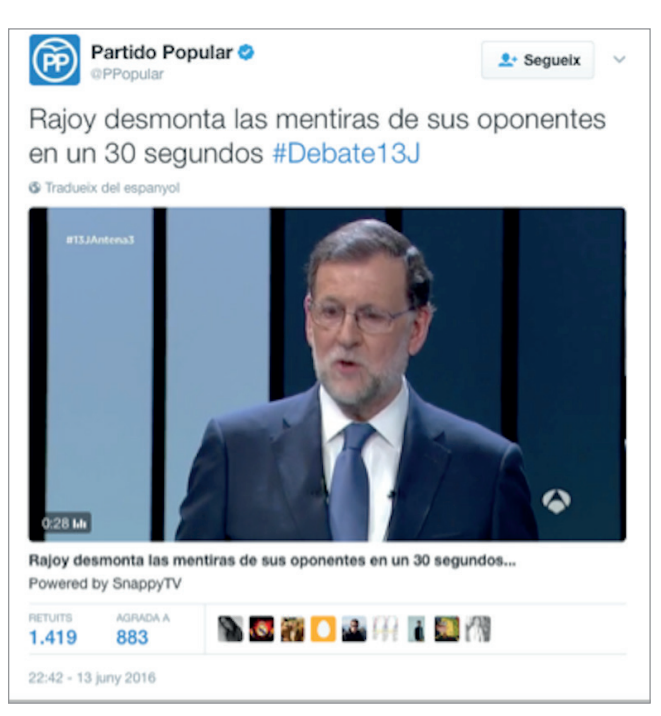
Image 3. Most retweeted tweets of the parties<sup>3</sup>

The candidates of the emerging parties were those who employed this strategy of hybridization the most. Twitter acted as a tool through which the leaders of the new politics sought to enhance their media projection. TThis fact reaffirms the importance mainstream media continue to have during election campaigns, even in the digital environment (Casero-Ripollés; Feenstra; Tormey, 2016).