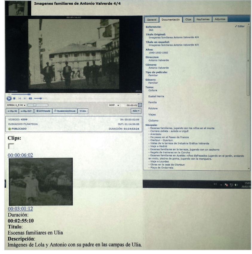
Image 3. Extract of the most comprehensive document analysis worksheet of the Basque Film Library .

Given that this type of analytical methodology is not applied across the board, we asked the film libraries that do not systematically apply it to whole films (even though they are only specific films or collections) whether they had considered doing so. In response to our question, the Andalusian Film Library claimed that it had considered the possibility, whereas the Basque Film Library , which does indeed perform this type of analysis, but only on specific clips, had not considered it.