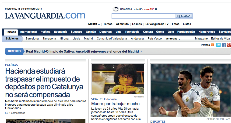
Screenshot of the homepage of www.lavanguardia.com . Mix of hard news and anecdotal content. December 18th, 2013.

Category 3. Sensational or anecdotal news: It includes