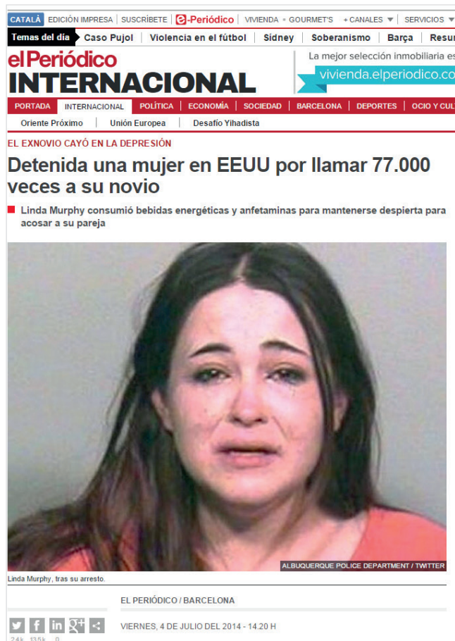
Anecdotal content published on www.elperiodico.com . June 4th, 2014.

list and their presence across the newspaper web sites is not insignificant. They represent between 5 and 10% of all news published. The anecdotal is no longer an anecdote.