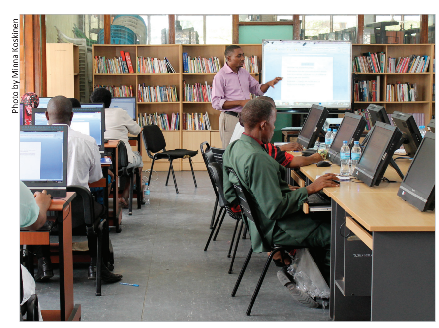
ICT training in libraries in Tanzania http://kirjastotjakehitys.suomenkirjastoseura.fi/in-english

If we wish to secure as many working places in libraries as possible, in spite of the economic downturn and difficulties in national and local budgets, then it is crucial to clearly communicate the importance of qualified staff to good library and information services and in that way to the concept of strong libraries. Even though we have some libraries in Finland and in some other countries open for extended hours without staff being present, that does not mean libraries no longer need trained staff. This new concept allows libraries to offer their facilities and collections to users for longer opening hours in