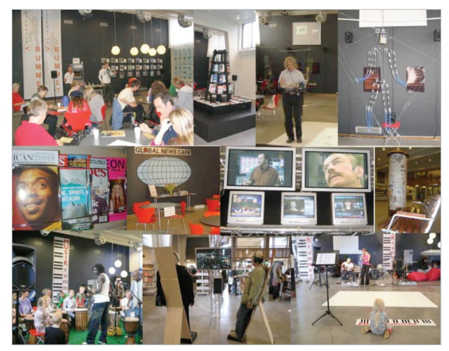
New times, new library activities (Schulz, 2014)

to-date resources relevant to their needs, including digital content.