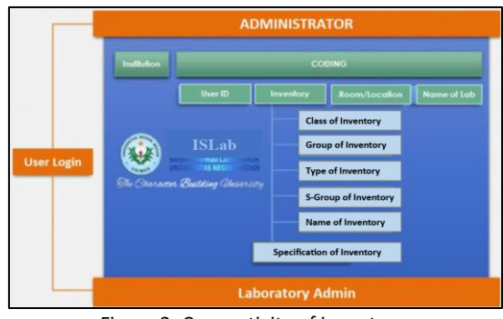
Figure 2: Connectivity of inventory.

The operational system, inventory data connectivity and report are displayed in Figure 2 and 3. There are five access domains, with a login system as the main access gate. The program database schema includes system login, menu manager, inventory data, circulation and transactions, maintenance, and reports.